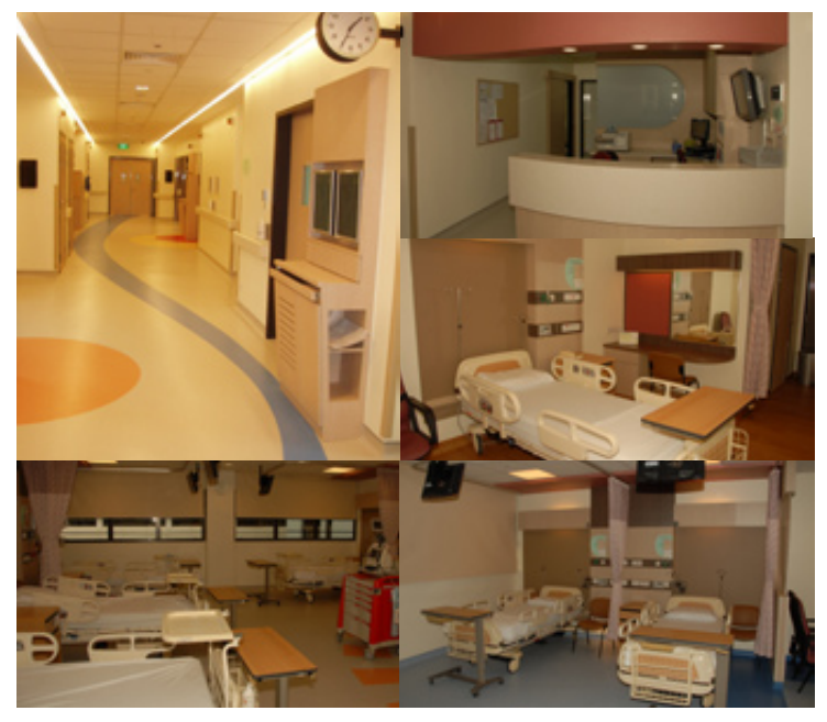
To enhance patient safety and comfort as well as improve workflow, NHCS recently gave its wards a mini 'facelift'.