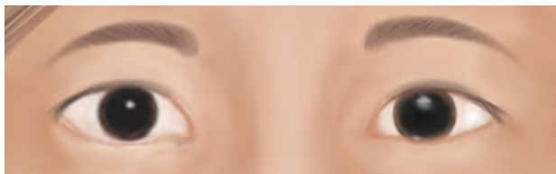
Illustration: Overhanging skin from the eyelid margin

The eyes are often the first features that draw attention and therefore form an important aspect of facial attractiveness and beauty. Over time, ageing can cause the upper and lower eyelids to appear droopy or become baggy.