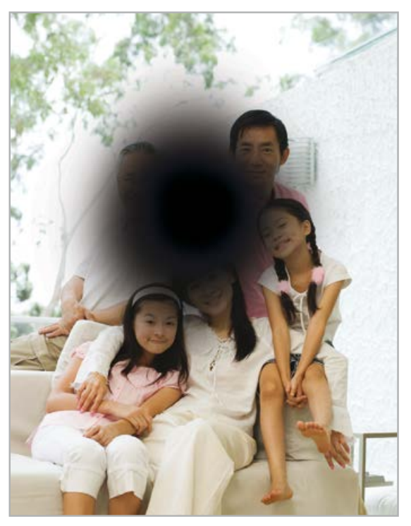
Vision with AMD